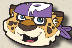
Cheetah Pirate Scouts