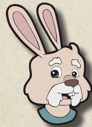
Phillip the Rabbit Trailblazers