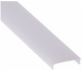
Polycarbonate cover LED-18.064 opal 3m