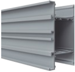
Aluminium profile LED-09.006 anodised silver 3m