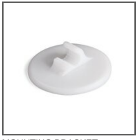
MOUNTING BRACKET POLI C24112C10 Ref. arch 24112