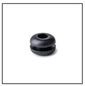
GLAND 6x1,2 C24517C07 Ref. arch 00802