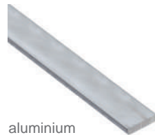
aluminium Inner plate LED-22.019 (2000x14x0.75mm)