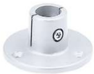
Tubular base LED-22.124 white