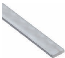
Inner plate LED-22.143 aluminium 6.56ft x 11in x 0.03in