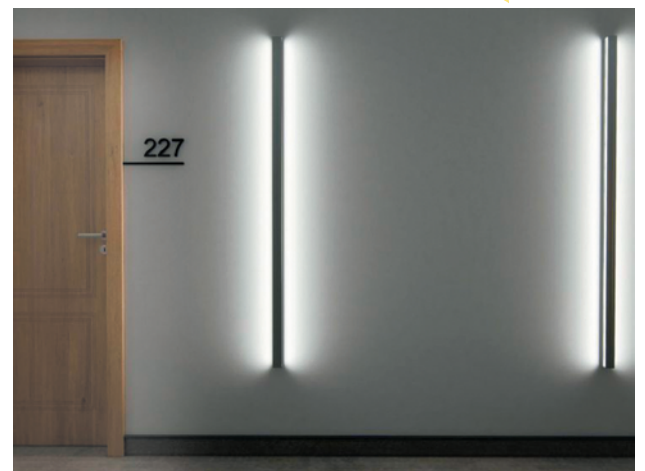
Option: aluminium skirting board