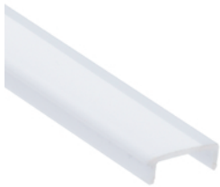
Polycarbonate cover 18.063 opal 3m