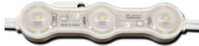
LED Modules are covered by US Design Patent D861,922 S

Protection Class .....IP68..... Operating Temperature. ....-22°~ 158° F Life Rating .....>50,000.hours Fastening .....3M.tape.& mechanical