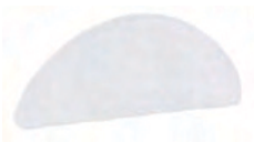
Endcaps LP166 frosted methacrylate