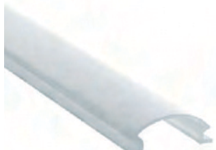
Methacrylate diffuser LPBE/1 frosted 2 mt.