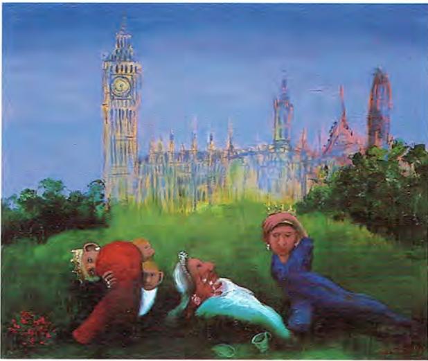
'The Legacy of Young Queens' Oil on Canvas 30 x 35 1/2 ins 760 x 900mm

124-126 The Cut, Waterloo, London SE1 8LN (Opposite the Old Vic Theatre) Tel. 0171-620 1322/1324 Fax: 0171-928 9469 web: http://www.users.dircon.co.uk/~lafp/index.htm email address: lafp@dircon.co.uk Open Monday to Saturday 10am to 7.30pm.