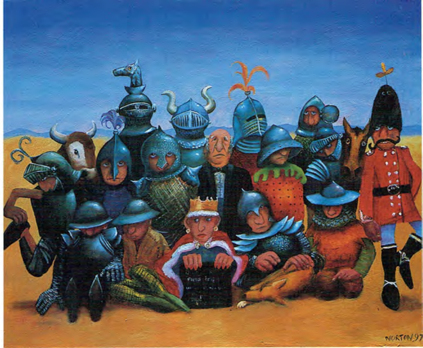
'Dark Knights in the Sun' 'Tardis'