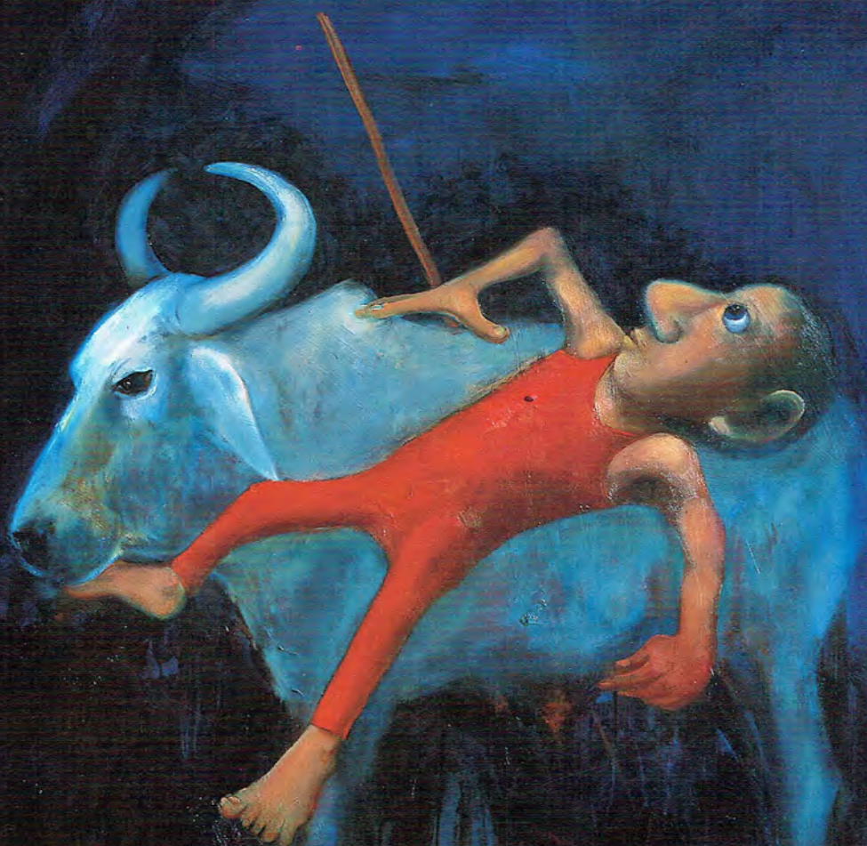
'Vaulting Bull' Oil on Canvas 47 1/2 x 35 1/2 ins 1200 x 900mm