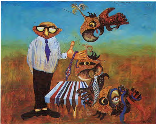
'The Expatriate Merchant' Acrylic on Canvas 24 x 30 ins 610 x 760mm