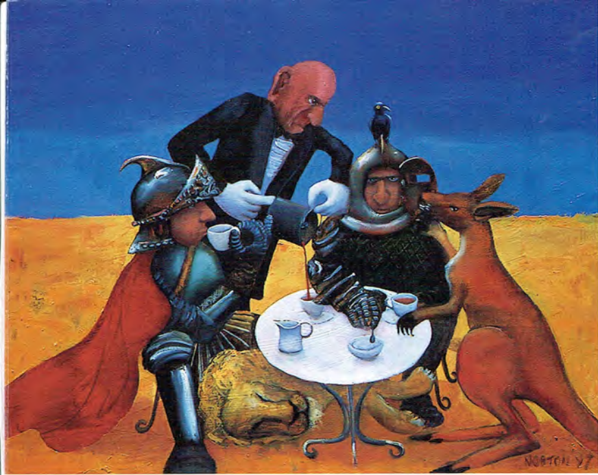
'Patriots' Tea Party' Oil on Canvas 24 x 30ins 610 x 760mm 'The Dark Knight (Mr Europe)' Oil on Canvas 30 x 24ins 760 x 610mm