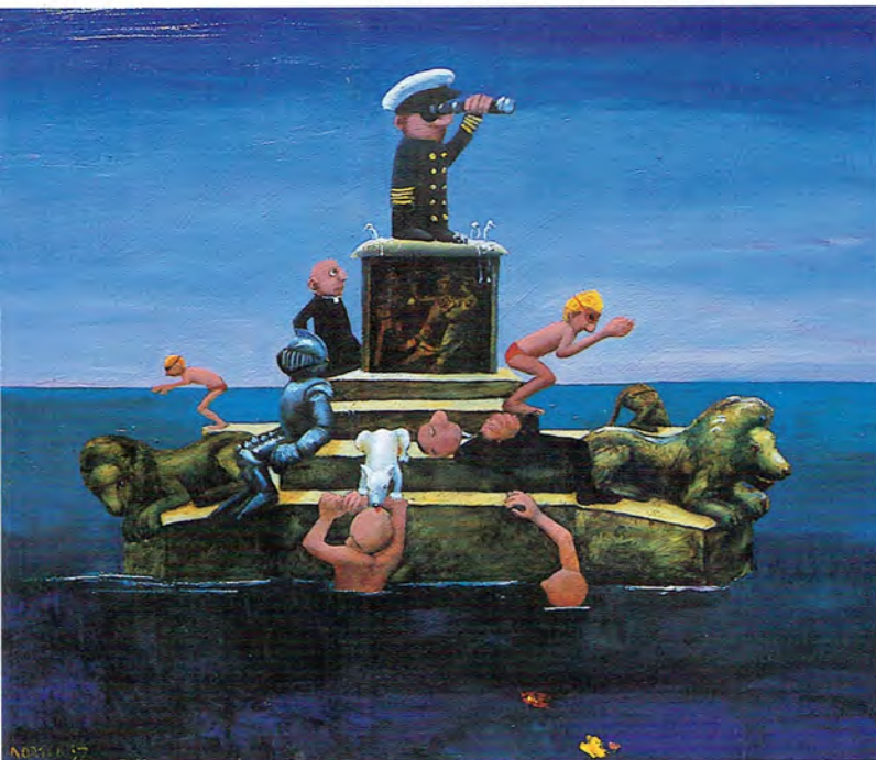
'Spinner' Oil on Canvas 24 x 20 ins 610 x 510mm 'Flotation' Oil on Canvas 30 x 35 1/2 ins 760 x 900mm