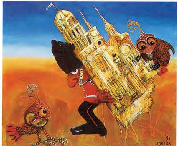
'Seeking Solitude in the Promise' Acrylic on Canvas 24 x 30 ins 610 x 760mm

This exhibition with its vibrancy of colour and originality of ideas promises to be one of the highlights of the New Year in London – an exhibition of strength, colour and humour from a very special artist.