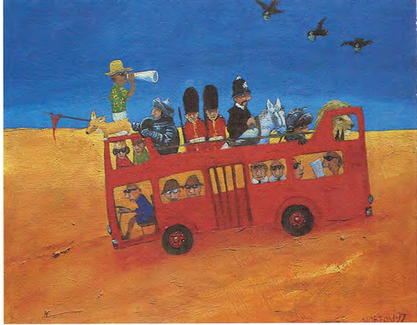
'The Red Bus Trip'

Oil on Canvas 35 1/2 x 30ins 900 x 760mm