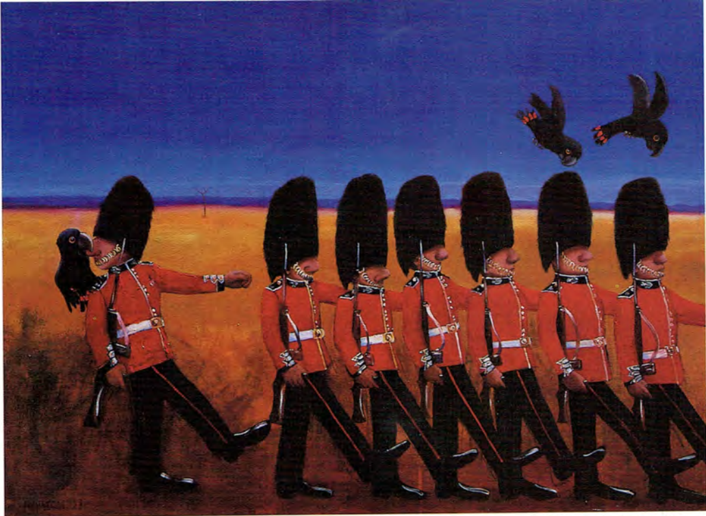
'Red and Black' '15 Knights with a Queen'

Oil on Canvas 35 1/2 x 47 1/2 ins 900 x 1200mm Oil on Linen 35 1/2 x 47 1/2 ins 900 x 1200mm