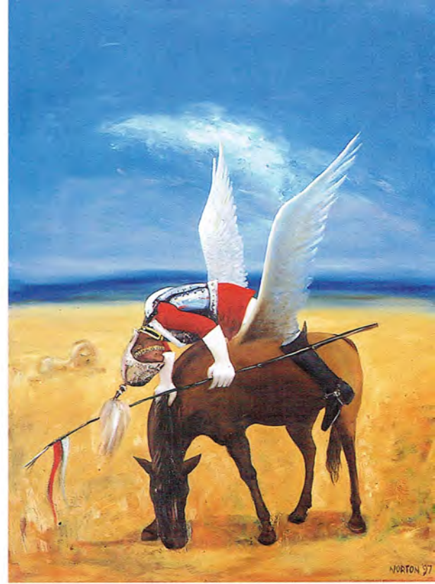
'Pegasus & The Tin Man' Oil on Linen 47 1/4 x 30 7/8 ins 1200 x 900mm 'The Battle of Promise (Unicorn)' Acrylic on Canvas 20 x 24ins 510 x 610mm