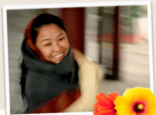
Khandro Thrinlay Chodon Rinpoche

Note re arrival to Kochi: The resort is 1-2 hours drive from the airport. We leave from Kochi Marriott airport hotel around 9-10am on 14th, so most people like to arrive during the day of the 13th and stay one night. (extra charge). Please let me know if you wish to stay at this hotel or any other nearby hotel. Any whom do wish to arrive on the early morning flight on the 14th (around 9 am) we will pick you up and transfer you with Rinpoche direct to the resort.