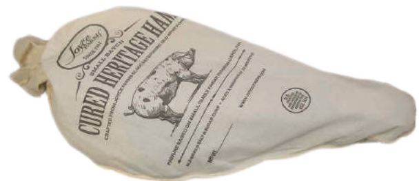
Packed in traditional keepsake bag