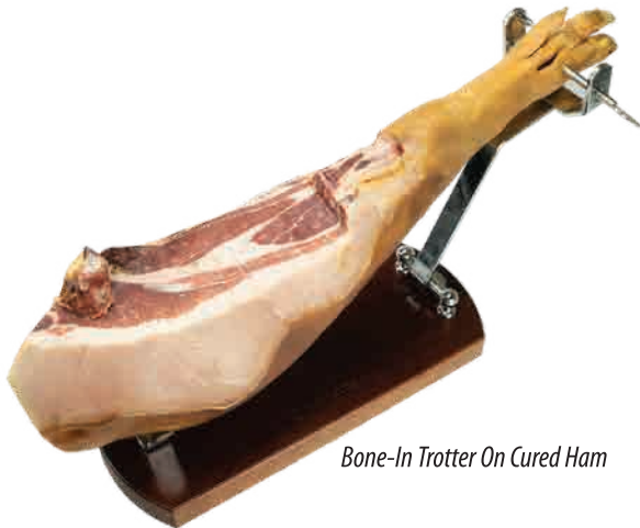
Bone-In Trotter On Cured Ham