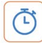
Timer Control (5 Minutes - 12 Hours)