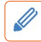
Long Life, Replaceable UV LEDs