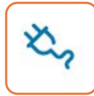
International Power Options