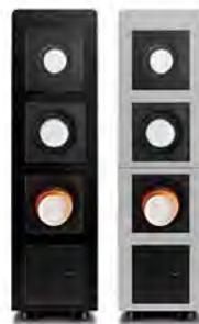
modul on cups

Configuration Modular with drawers, cups and lids for coffee to-go.