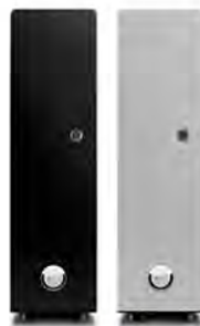
modul on water

It can be combined with iEC anti-guarde.