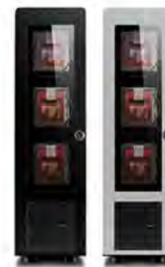
modul on dispenser

Configuration 4 modular spaces with drawers, cups and lids for coffee to-go at your choice.