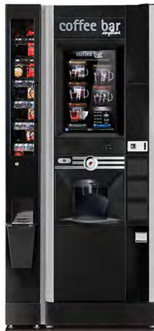
side < dispenser + luce X2 touchTV