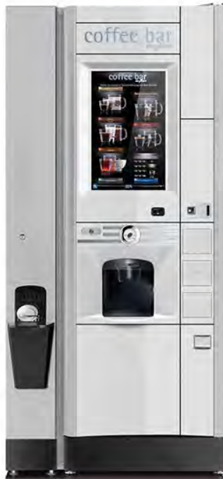
side < lids + luce x2 touchTV