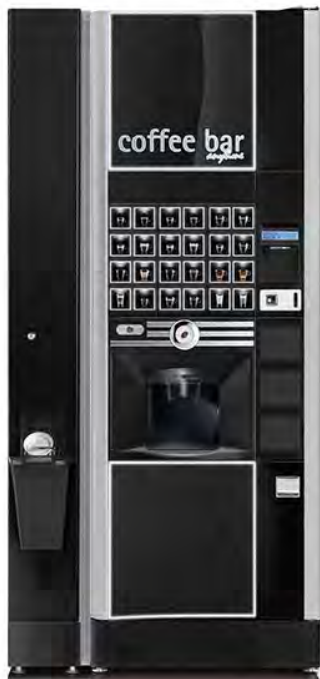
side < lids + luce x2

A range of modules for perfectly combining free standing machines for the best possible customer experience. Two families are available: lid dispensers and teabag/infusion bag dispensers.