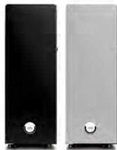
modul on cappuccino