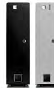
modul on change giver

Configuration Modular with drawers, cups and lids for coffee to-go.