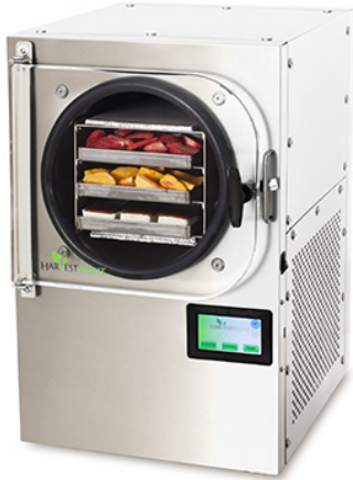
Stainless Steel (recommended)