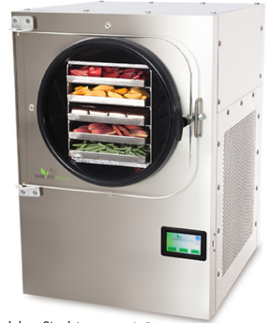
Stainless Steel (recommended)