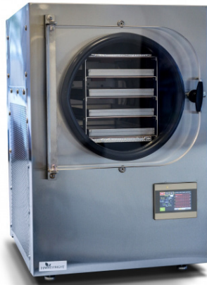
Stainless Steel (recommended)