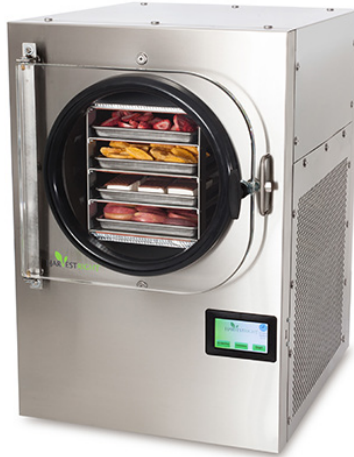
Stainless Steel (recommended)