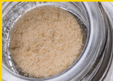
6 star full melt hash