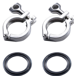
Bruteless Clamps and Gaskets