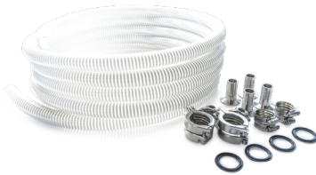
Bruteless Complete 2 Hose Kit