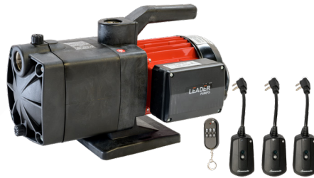
Bruteless Water Pump w/ Optional Remote Control