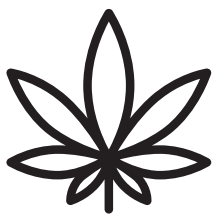
Fresh frozen or dry flower/trim

Ice water hash, which is also known as bubble hash, consists of pure, isolated, trichome heads and stalks. When done properly, this is the best resin that the cannabis plant has to offer, and can be enjoyed as-is or pressed into a variety of different types of premium rosins.