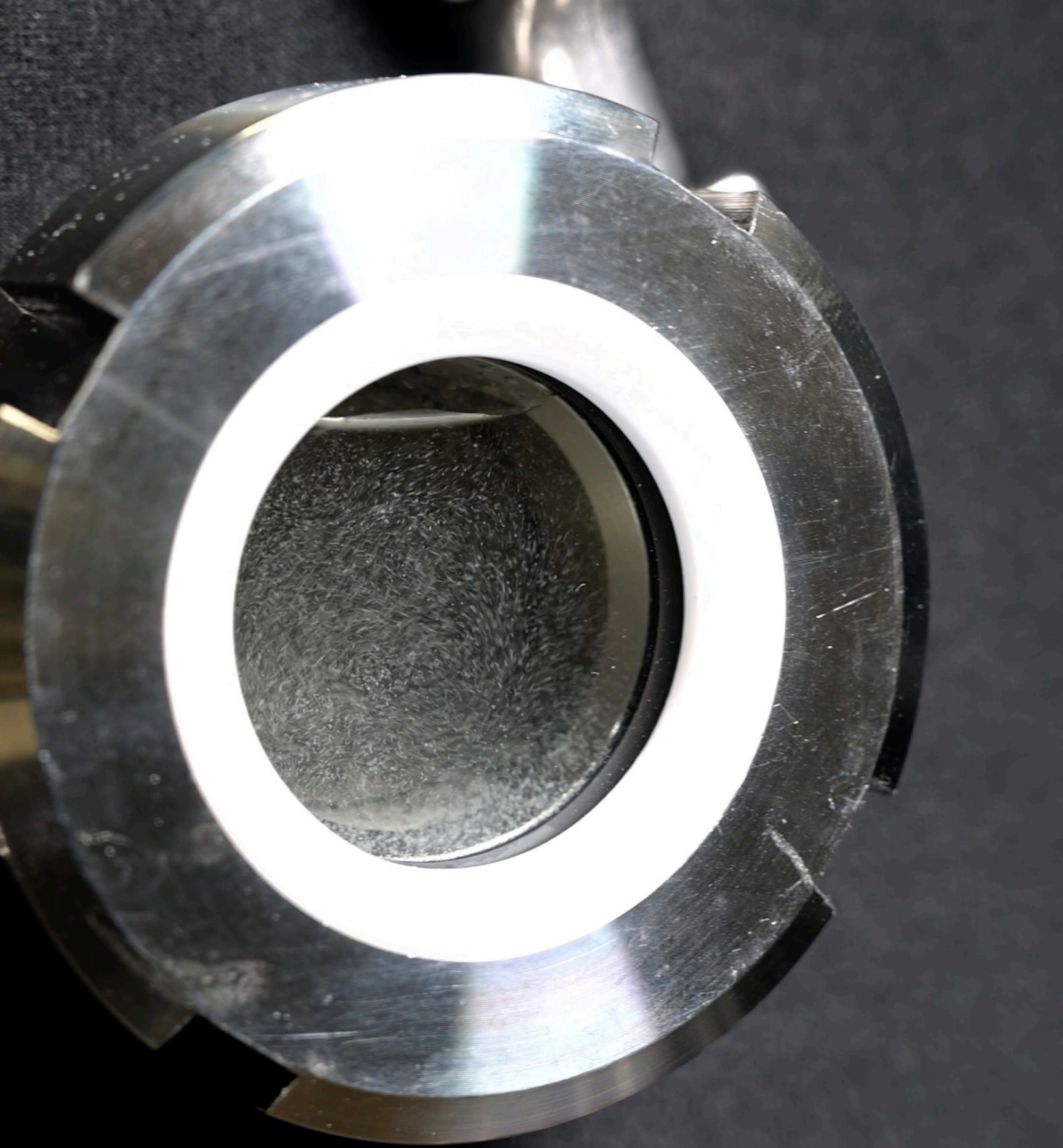
Trichome heads being washed viewed through the Bruteless Sight Glass.