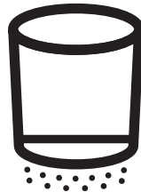
Filtered through bubble bags