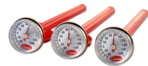
Hash Temperature Probes

With even more accessories available on our website, let our experts help you configure the perfect Bruteless system for your needs.