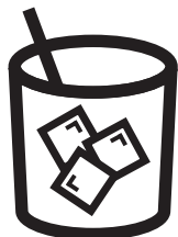
Washed in Bruteless