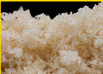
Full spectrum ice water hash

Bruteless™ vessels can make every type of ice water hash, including full melt or six star hash, which is sought after by connoisseurs the world over.