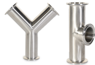
Stainless Steel Fittings