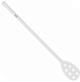
Polypropylene Hash Washing Paddle

Visit our online shop at www.purepressure.com for details and pricing.