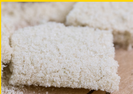
Full spectrum ice water hash

Bruteless™ vessels can make every type of ice water hash, including full melt or six star hash, which is sought after by connoisseurs the world over.