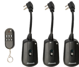
Bruteless Water Pump Remote Control