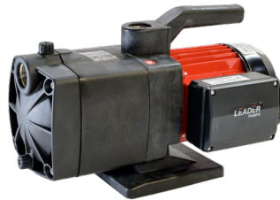
Bruteless Water Pump with Fittings