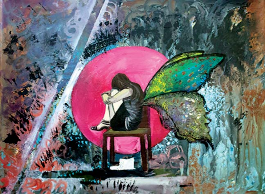
Flying In A Fixed Region Acrylic on Canvas 30x24"