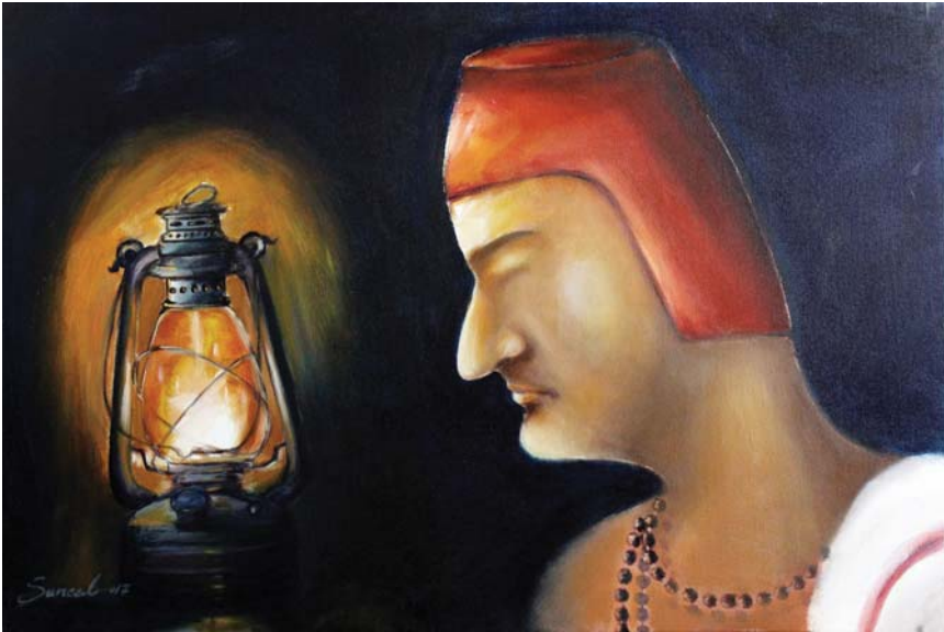
Original Painting of Saint Surdas Acrylic on Canvas 36x24"