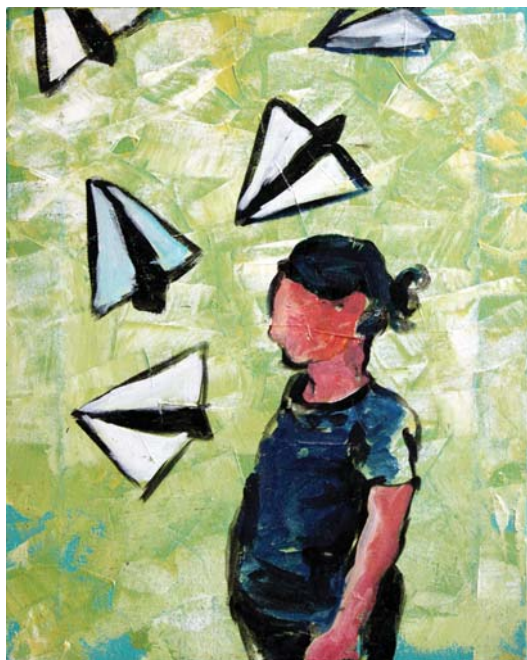
Flight Of Dreams Acrylic on Canvas 15x12"