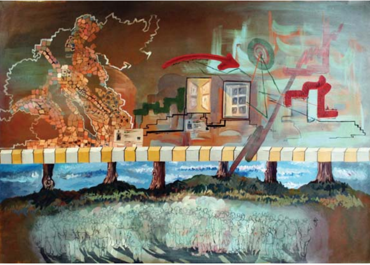
Urbanization and the Displaced Acrylic on Canvas 37x25"