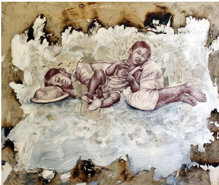
Life Of The Size Of A Newspaper Acrylic on Canvas 36x30"