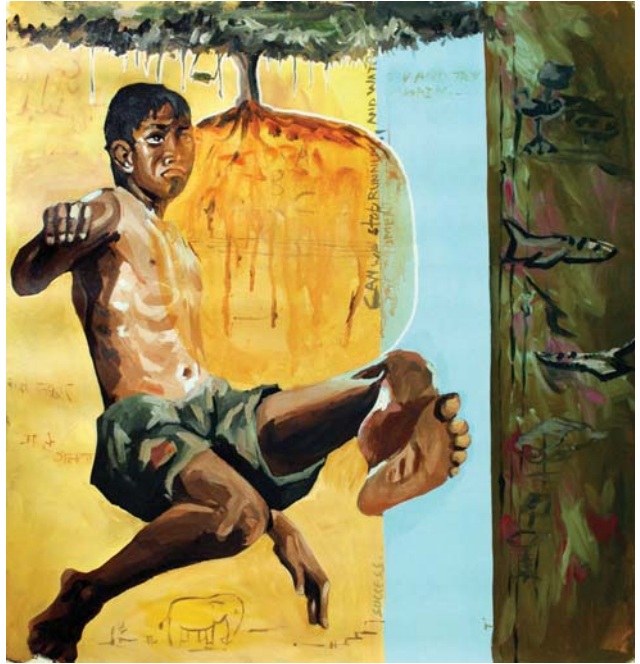
Flight Of Dreams Acrylic on Canvas 23x23"