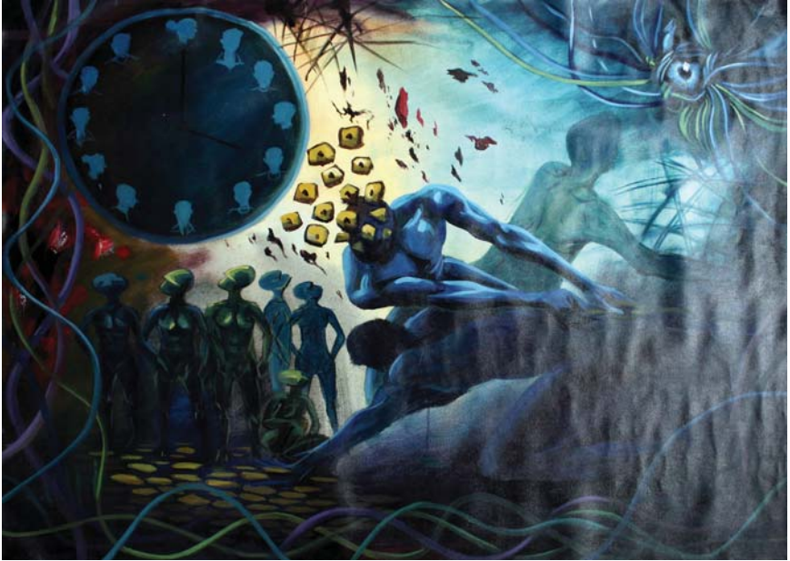
The Inclusive Growth Acrylic on Canvas 48x36"