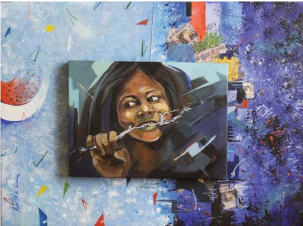
Life Inside The Caged Land Acrylic on Canvas 30x23"