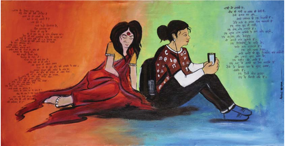
Indian Women And The Differences Acrylic on Canvas 35x18"