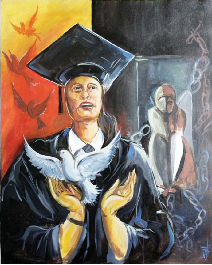
The Limited Flight: Women in 21st Century India Print on Paper 42x34"