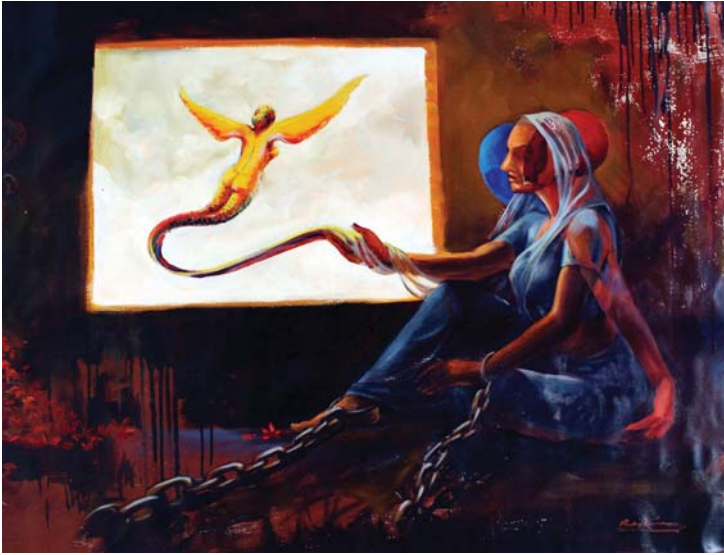
Chained Freedom Acrylic on Canvas 48x36"