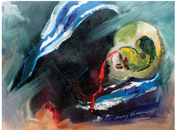
Original Painting Of Saint Teresa Acrylic on Canvas 16x12"