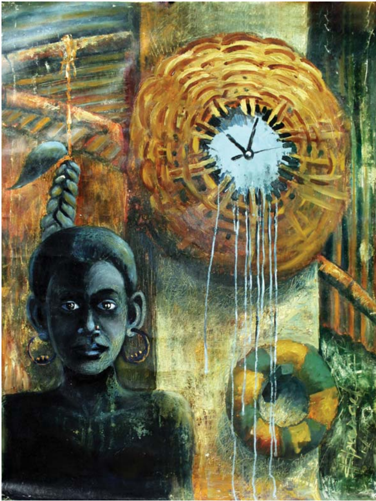
The Settled Occupation Acrylic on Canvas 31x37"