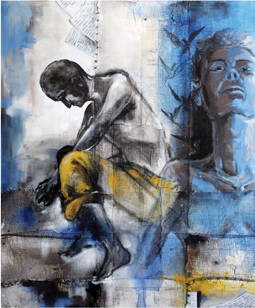
The Stitched Life Acrylic on Canvas 29x35"