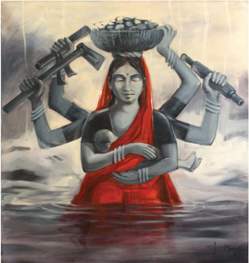
Woman And Her Weapons Acrylic on Canvas 36x40"