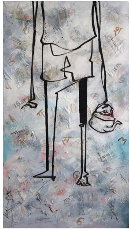
A Crippled Future Acrylic on Canvas 18x34"