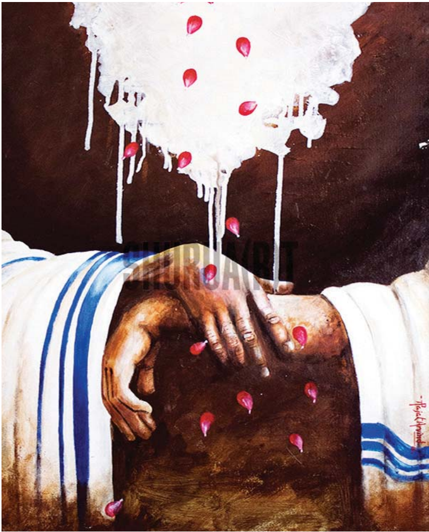
A Life In Service: Saint Teresa Acrylic on Canvas 24x30"