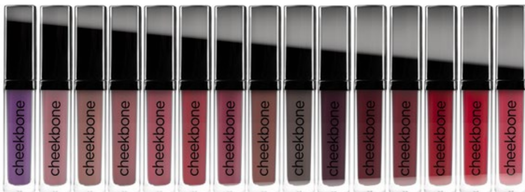
Warrior Women Liquid Lipstick