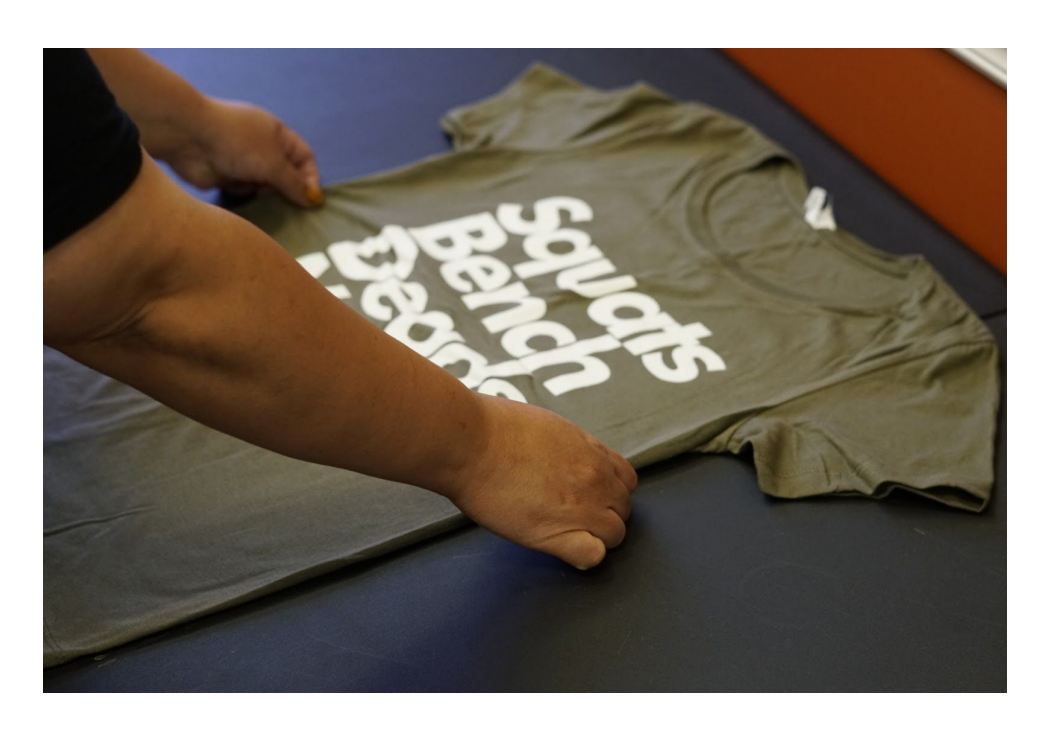
STEP 2: Measure from the outermost point