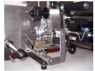
Date / Lot No. Printer