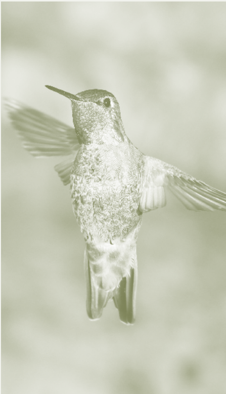
Anna's Hummingbird, a year-round species in the Pacific Ranges ecoregion.