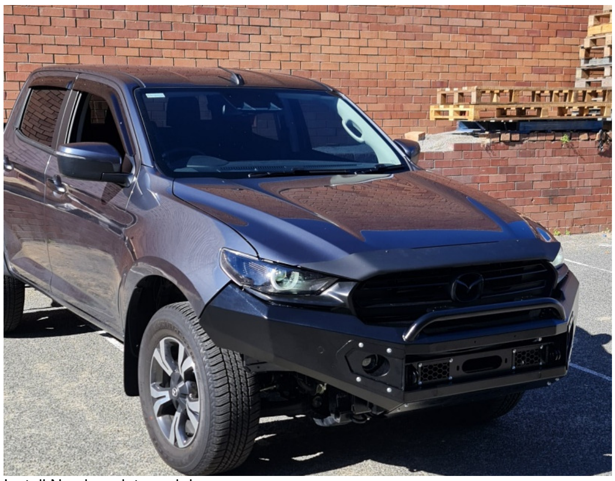
Install Number plate and done.