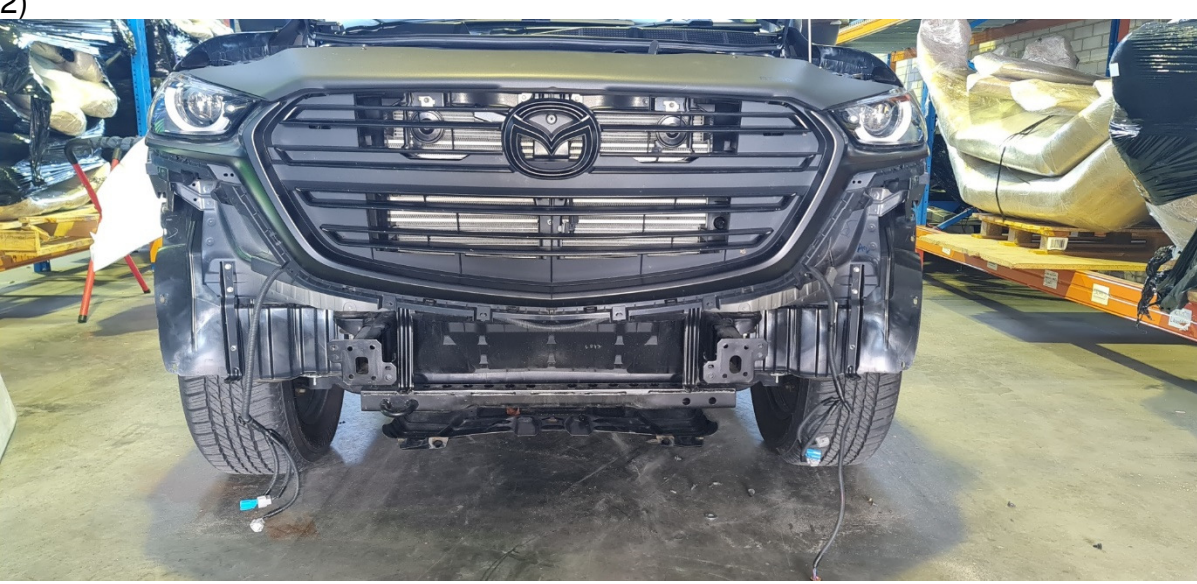
The bullbar comes with chassis reinforcement collars, install these before installing the main winch cradle. The collars go on finger tight.