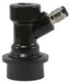
Black Disconnect Plastic or Steel