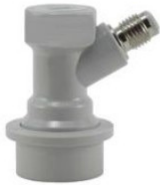
White Disconnect Plastic or Steel