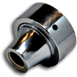
Tap Shank Adapter