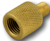
M8 - MFL Swivel Adapter