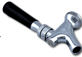
Chrome or Steel Beer Tap