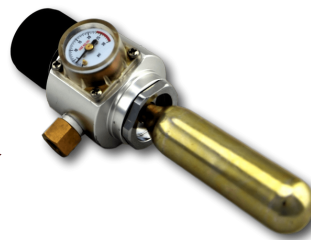
Professional Quality Mini Regulator