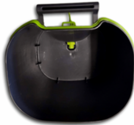
Coffee maker bucket (shown with tap in place)