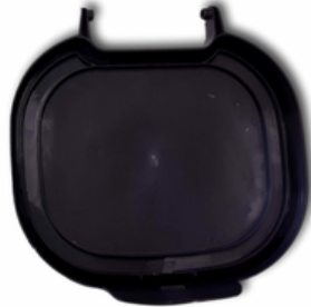
Coffee maker lid (with easy clean removable seal)