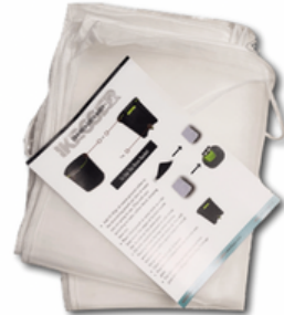
25 micron nylon coffee bag (with drawstring for closing and securing to bucket)