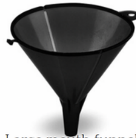
Large mouth funnel (for filling our mini kegs)