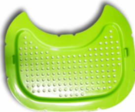
Perforated coffee pouch platform