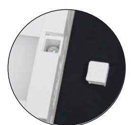
Pre-positioned installation screws