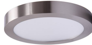
Shown with brushed nickel finish