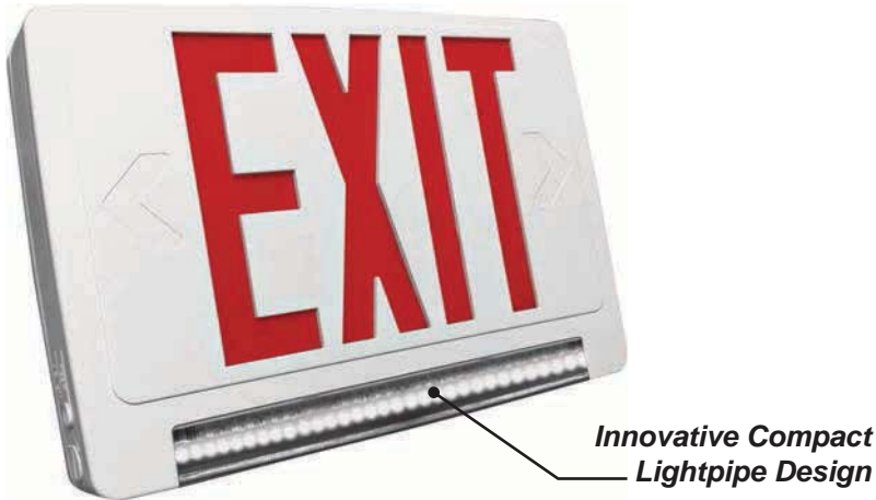
Innovative Compact Lightpipe Design