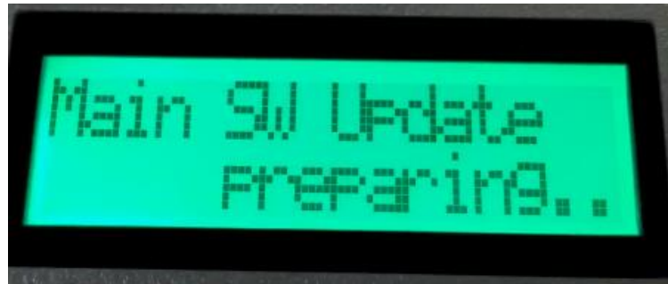
Figure 2. Software Update Text