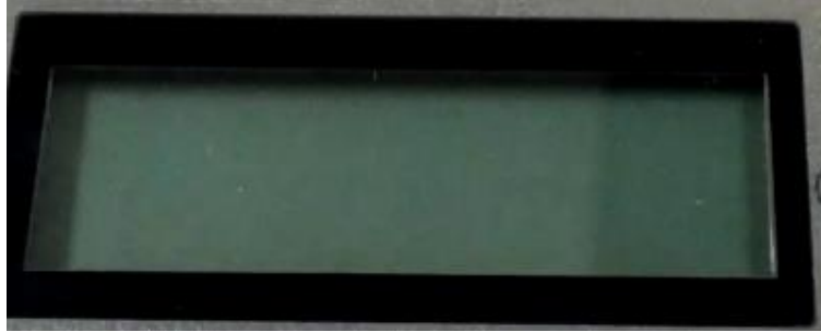
Figure 3. Upgrade Process Complete