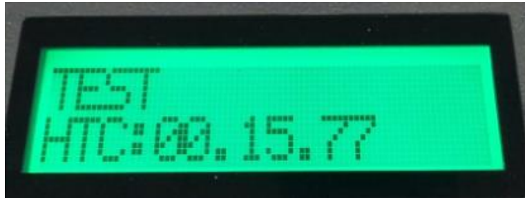
Figure 4. HTC Version