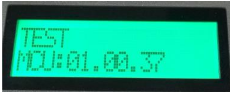
Figure 5. MCU Version