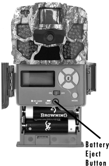
Battery Eject Button

Slide the battery tray into the closed position.