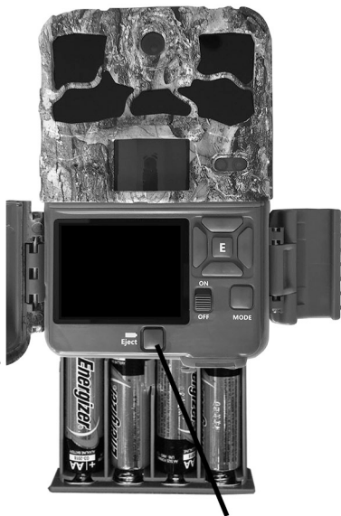
Battery Eject Button

Slide the battery tray into the closed position.