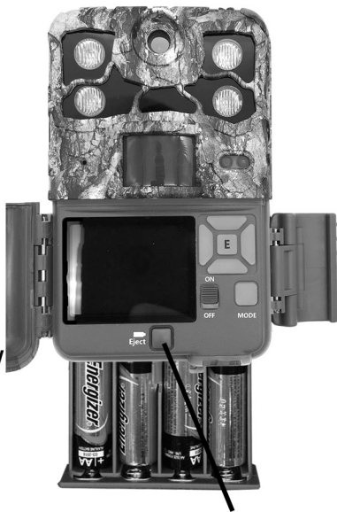
Battery Eject Button

Slide the battery tray into the closed position.