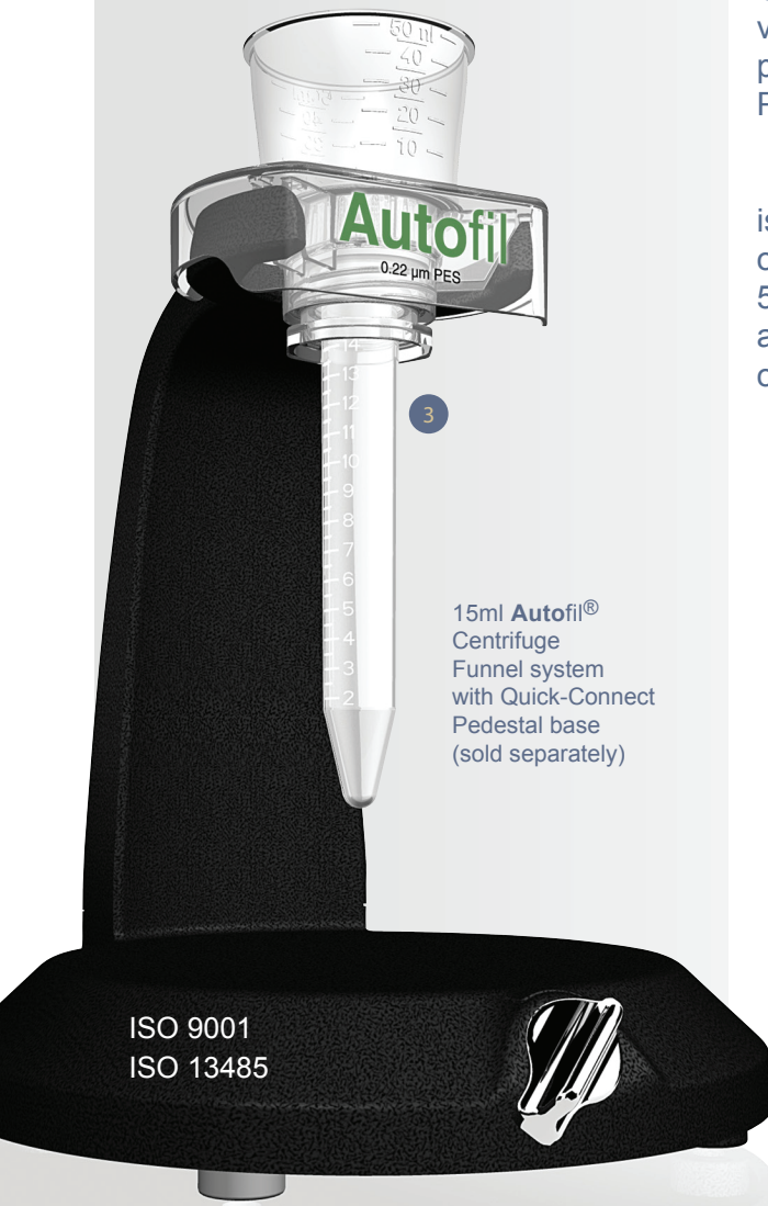
15ml Autofil® Centrifuge Funnel system with Quick-Connect Pedestal base (sold separately)

The Autofil® Centrifuge Funnel system is offered as a full assembly, or funnel only. Available sizes include a 15ml and 50ml centrifuge tube with 0.1 µm, 0.2 µm, and 0.45 µm PES membrane pore-size options.