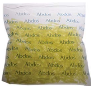
Last Drop Low Retention Pipette Tips, Bulk in Resealable Bags

Abdos range of Pipette Tips Racked for more details please visit us at www.abdoslifesciences.com/low-retention-pipette-tips.html