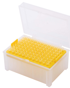
Last Drop Low Retention Pipette Tips, Sterile Racked