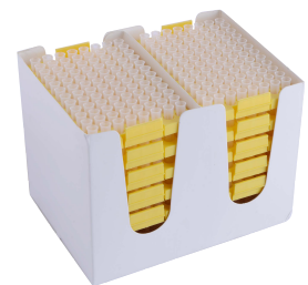
Last Drop Low Retention Pipette Tips, Refill Pack

For additional product or technical information, please visit www.ShopFLS.com . For distributor information contact sales@foxxlifesciences.com .