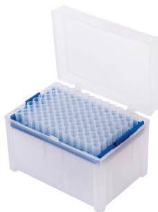
Last Drop Low Retention Pipette Tips, Racked