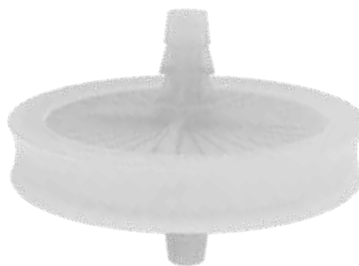
25H-1705-FLS Vent filter, 0.2µm, 40mm, Non-Sterile