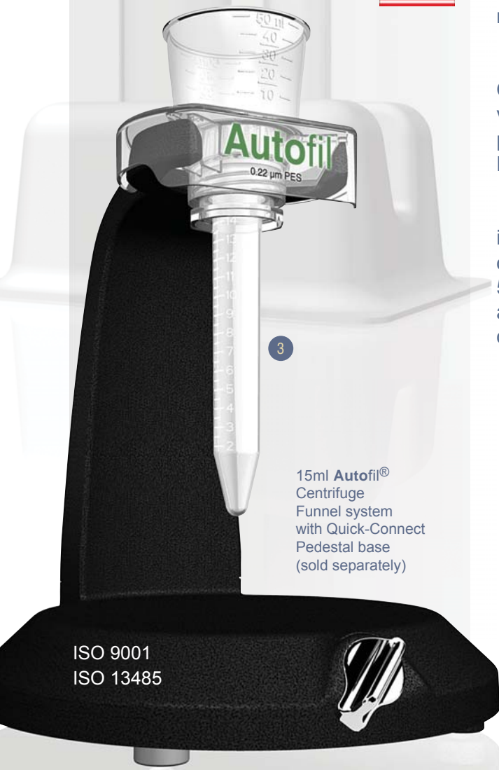
15ml Autofil® Centrifuge Funnel system with Quick-Connect Pedestal base (sold separately)