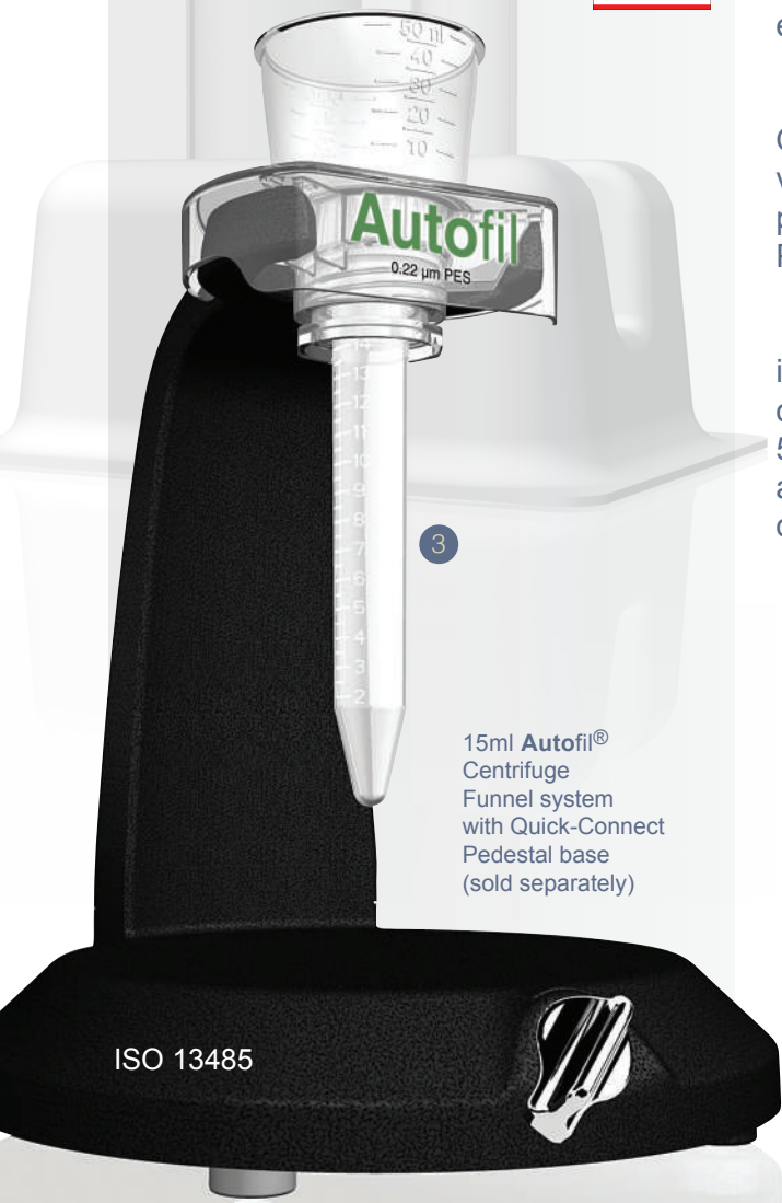
15ml Autofil® Centrifuge Funnel system with Quick-Connect Pedestal base (sold separately)

The Autofil® Centrifuge Funnel system is offered as a full assembly, or funnel only. Available sizes include a 15ml and 50ml centrifuge tube with 0.1 µm, 0.2 µm, and 0.45 µm PES membrane pore-size options.