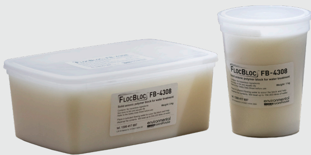
DamClear FlocBlocs: two sizes - 3 kg and 1 kg