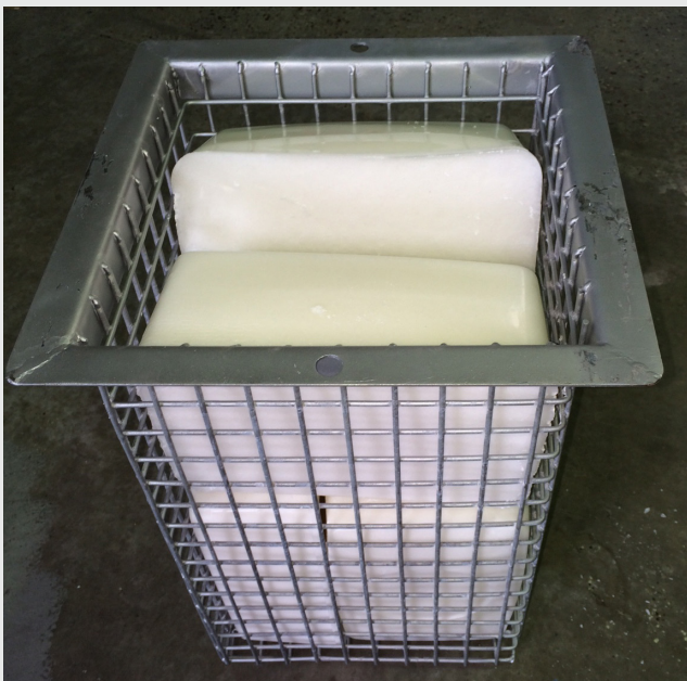
Use 1–4 FlocBlocs in a cage depending on flow