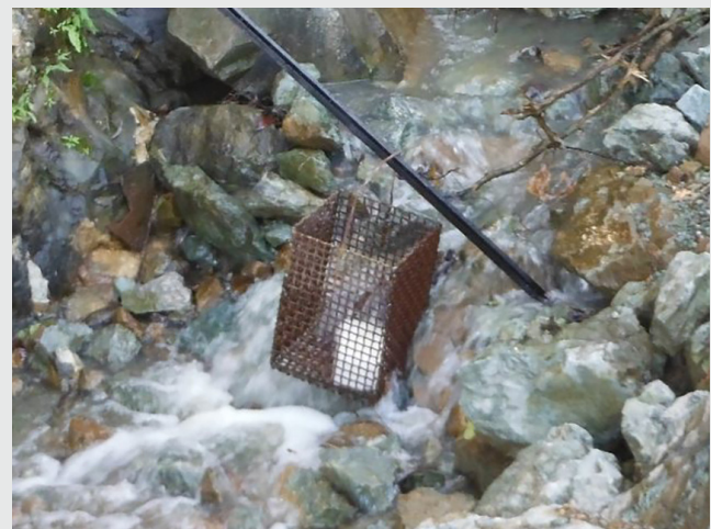
DamClear FlocBloc in a cage at a quarry