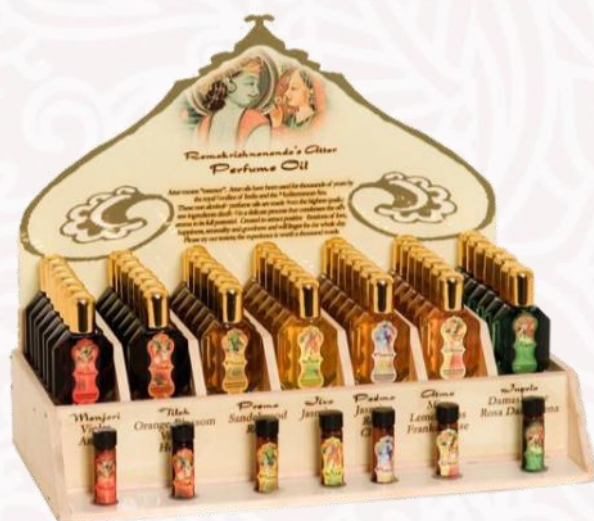
PERFUME ATTAR OIL RACK PACKAGE FREE display rack and oil testers with an order of seven bottles of seven scents of attar oil. SKU: 100-01