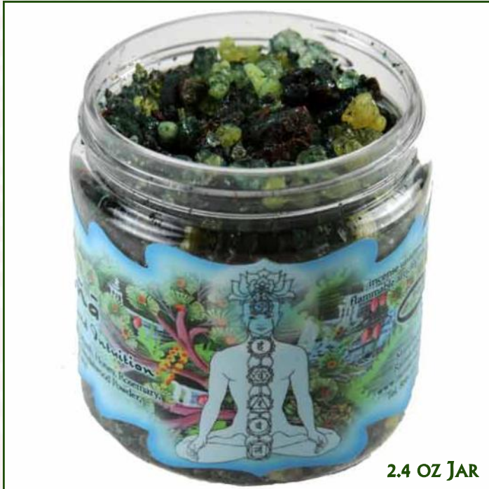
2.4 OZ JAR