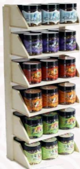
HERBAL RESIN INCENSE PURPOSE LINE RACK SKU: 100-02