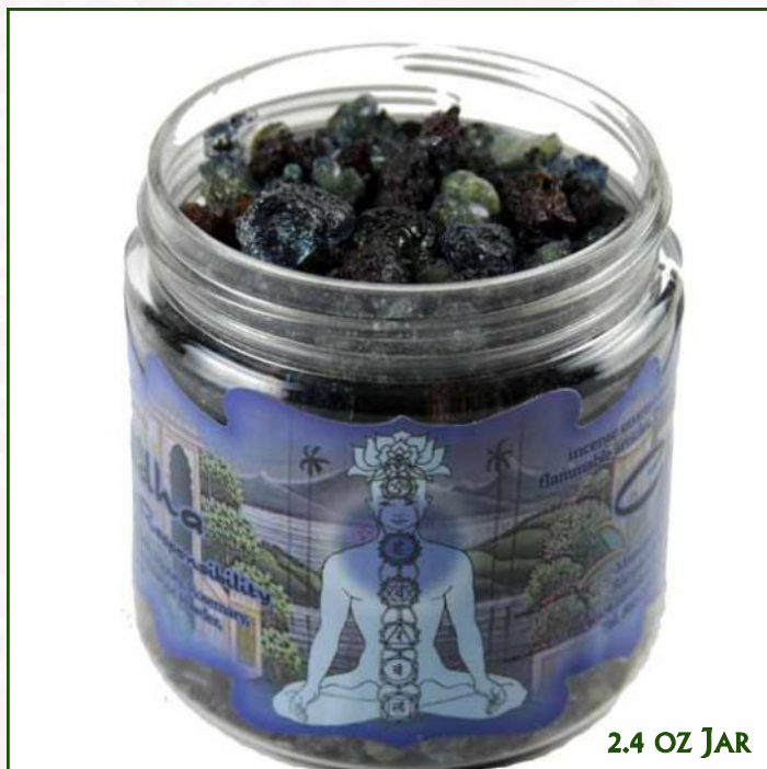
2.4 OZ JAR