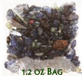
1.2 OZ BAG