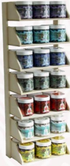
CHAKRA SERIES RESIN INCENSE JAR RACK SKU: 100-07