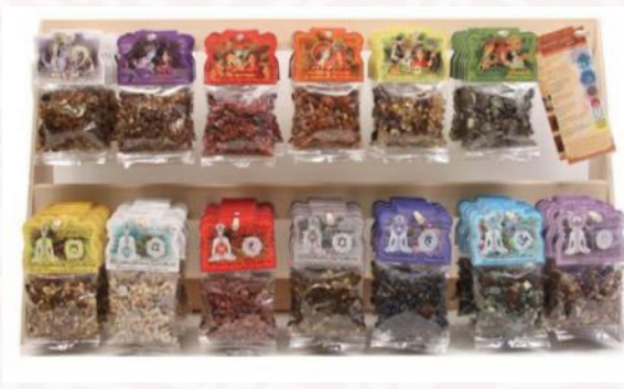
CHAKRA SERIES RESIN INCENSE BAG RACK SKU: 100-08

For sales, information, and customer service, please contact: Prabhuji's Gifts 858 Route 212 Saugerties, NY, 12477, USA: 1-866-202-9357 Fax: 1-888-821-1566 Email: sales@prabhujisgifts.com Website: www.prabhujisgifts.com