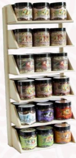
PURPOSE AND BASIC RESIN INCENSE RACK SKU: 100-11