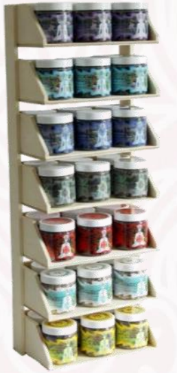
CHAKRA SERIES RESIN INCENSE JAR RACK SKU: 100-07