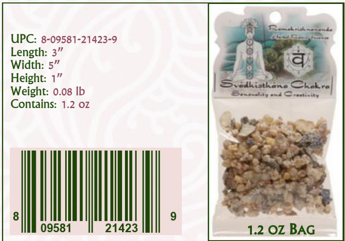
1.2 OZ BAG

WHY CUSTOMERS LOVE IT: This is an exotic blend of natural resins, aromatic herbs, spices and oil combined in accordance to the ancient wisdom of shamanism. It has been blessed with mantras to create an opening toward sensuality and creativity on the physical, emotional and spiritual levels.