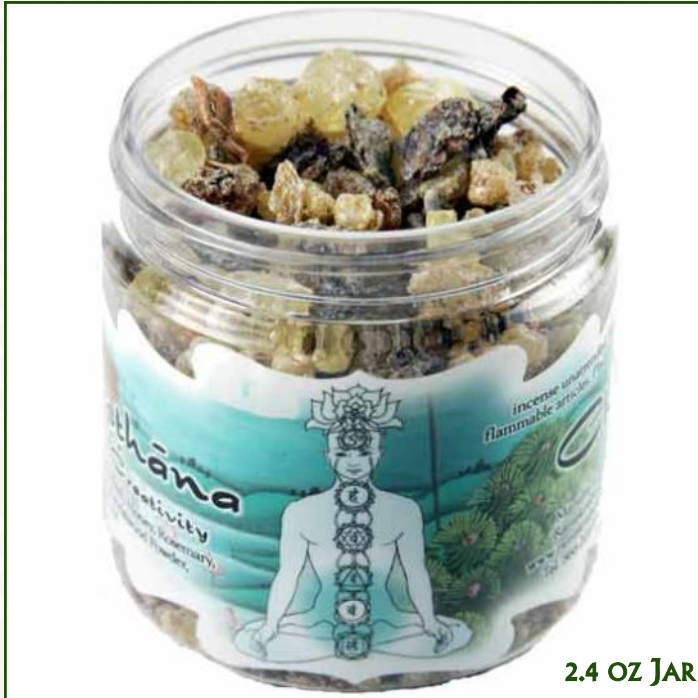
2.4 OZ JAR