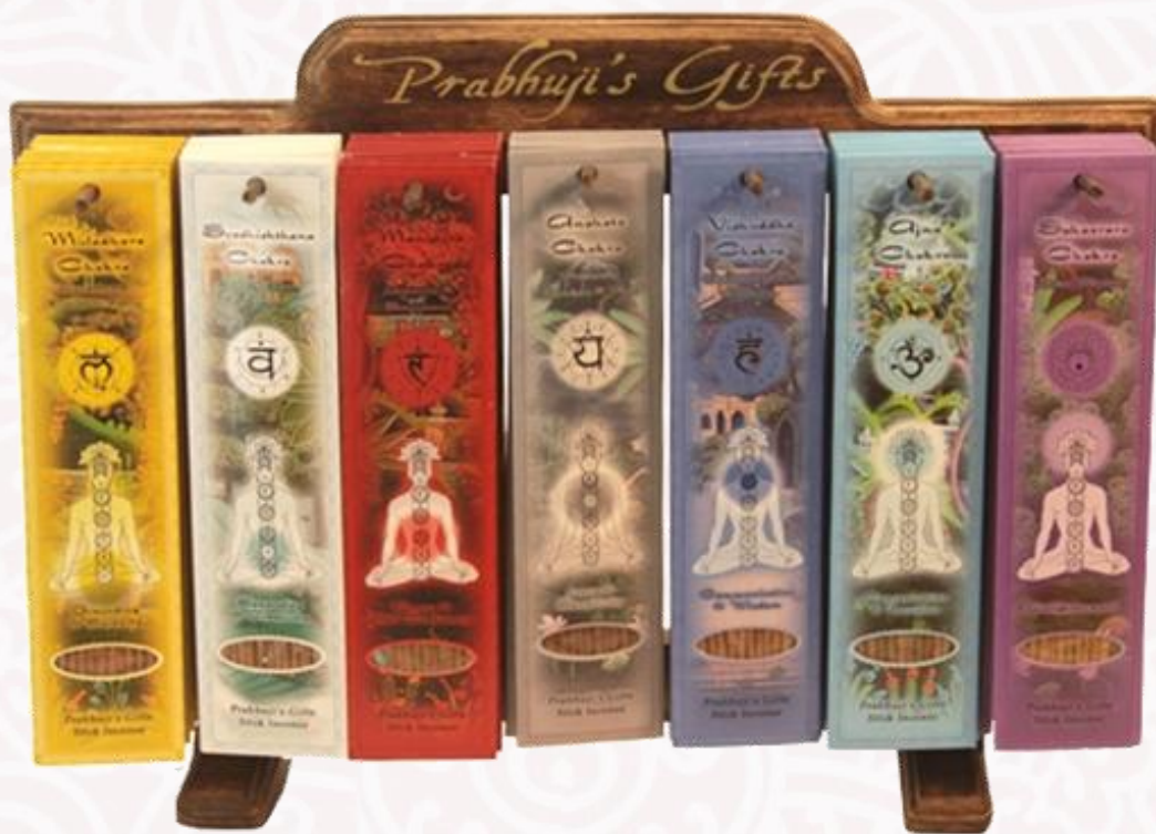
INCENSE RACK HORIZONTAL - 7 FRAGRANCES - SKU: 100-12

For sales, information, and customer service, please contact: Prabhuji's Gifts 858 Route 212 Saugerties, NY, 12477, USA: 1-866-202-9357 Fax: 1-888-821-1566 Email: sales@prabhujisgifts.com Website: www.prabhujisgifts.com