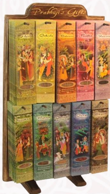
INCENSE RACK VERTICAL - 10 FRAGRANCES SKU: 100-05

For sales, information, and customer service, please contact: Prabhujī's Gifts 858 Route 212 Saugerties, NY, 12477, USA: 1-866-202-9357 Fax: 1-888-821-1566 Email: sales@prabhujisgifts.com Website: www.prabhujisgifts.com