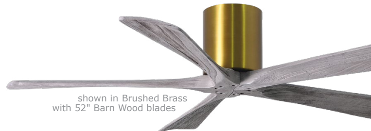
shown in Brushed Brass with 52" Barn Wood blades