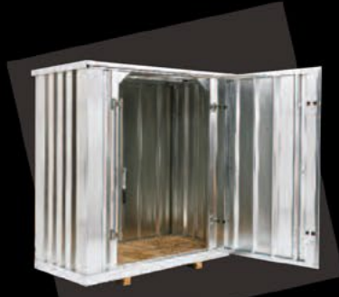
Half deep container | When space is limited