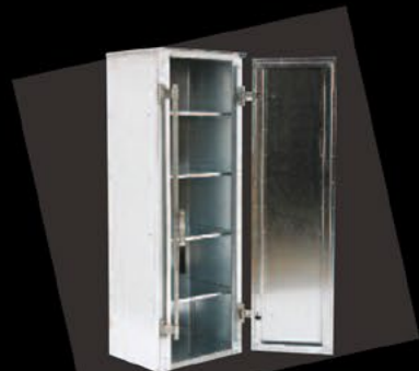
Storage locker | For garage or small shop