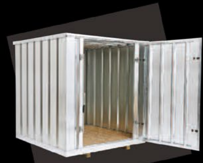
Standard container | Our most popular size