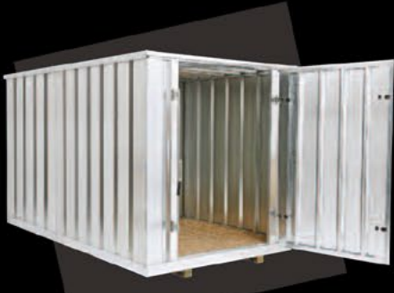
1.5 container | More room when you need it