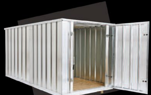
Double container | For larger equipment or big storage needs