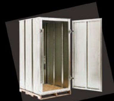
Skid container | For transport or general storage