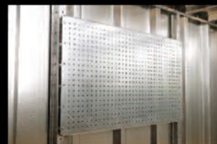
Accessories | Optimize your container