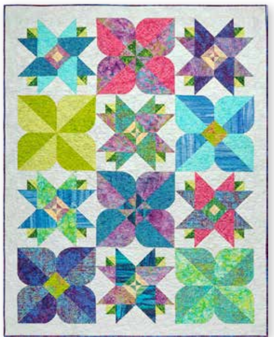
Island Batik, Jewel Box by Kathy Engle, Colourwerx Quilt: Mod Blossom, 66"x86"

The pattern and fabric designer has developed a pattern series that is fat quarter friendly and the patterns make two different quilts from one fat quarter bundle.