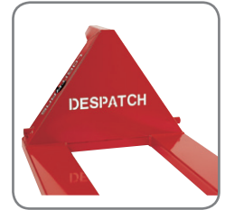
The company name or logo can be cut out in the triangle of the Panther.