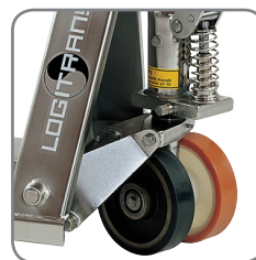
Different wheel types, to suit the needs of the user.