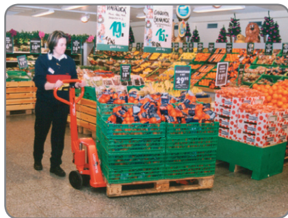
Adjustable fork height - no problems when handling low and worn pallets.