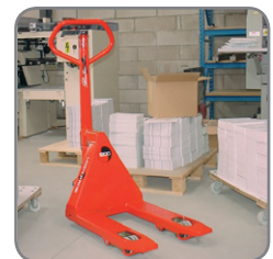
Panther is available with different fork lengths.