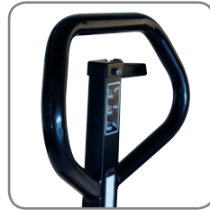
Ergonomic handle ensures the user a relaxed hold. Can be marked with name/department.

Stainless and explosion proof pallet trucks are also available.