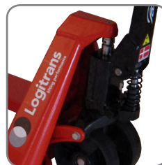
Permanent quick lift.