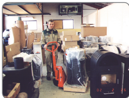
An easy handling of goods is ensured even in very confined spaces.