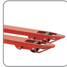
The hoop skates on the forks ensure an easy fork insertion and withdrawal in/out of pallets.