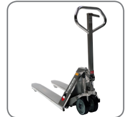
Strong construction ensures a long operating life and low maintenance costs.