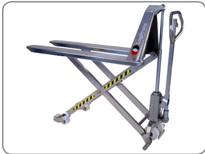
The standard trucks are manual and made of stainless steel.

The explosion proved construction is characterised by the following product mark: