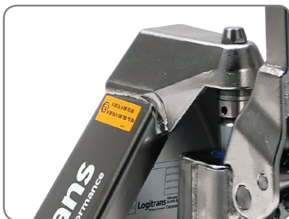
The explosion proof trucks are suitable for the pharmaceutical, chemical, oil, gas and paint industry.

II 2G Ex h IIB T6 Gb II 2D EX h IIB T85°C Db