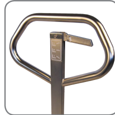
Ergonomic handle ensures the user a relaxed hold.

The trucks are categorised in equipment group II and are suitable for areas classified as zone 1/zone 21 (do also cover zone 2/zone 22). This means areas, in which an explosive atmosphere is generated occasionally due to different gases or dust.