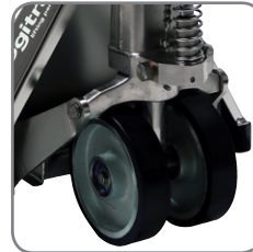
The trucks have two vulkollan anti-static wheels in order to conduct away static electricity.