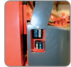
Easy access to all components makes service of the truck straightforward.