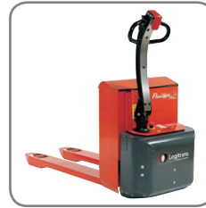
Strong construction ensures a long operating life and low maintenance costs.