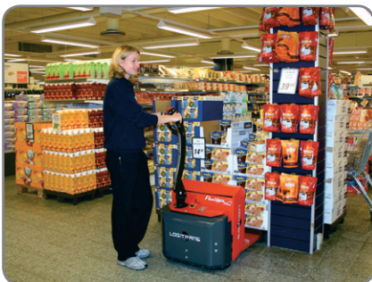
Panther Mini (capacity 1400 kg) is recommended for easy pallet transport, e.g. in super markets and in stock areas.