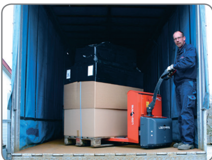
Panther Maxi (capacity 1800 kg) is recommended for heavy pallet transport, e.g. in the transport industry.