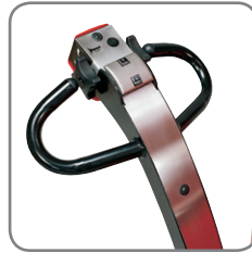
Possible to operate with handle upright. Central location of all control buttons.