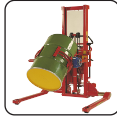
Available with side-tilting forks and/or optional extras, e.g. drum turner, remote control, level control, crane arm.