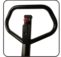
Ergonomic handle ensures the user a relaxed hold. The handle can be marked with the name/department.

Available with manual and electric lifting.