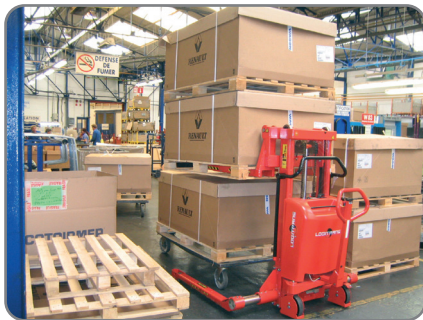
Strong construction ensures a long operating life and low maintenance costs.