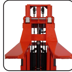
Adjustable forks are available in many different lengths and types.